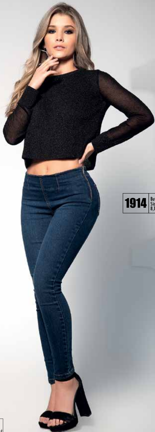
1914 Butt Lifting Jeans with Side Zipper 8,10,12,14