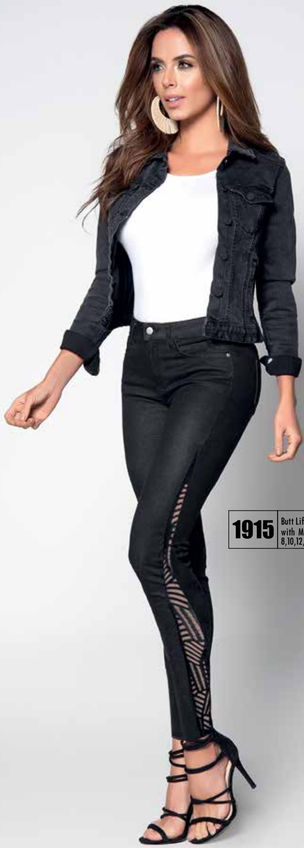
1915 Butt Lifting Jeans with Mesh Detail 8,10,12,14