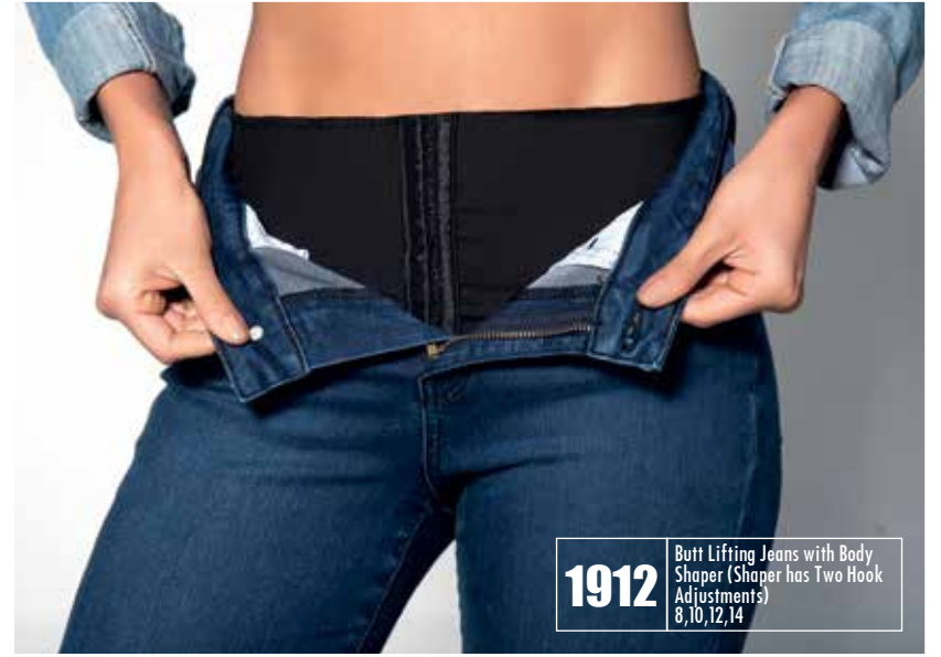
1912 Butt Lifting Jeans with Body Shaper (Shaper has Two Hook Adjustments) 8, 10, 12, 14