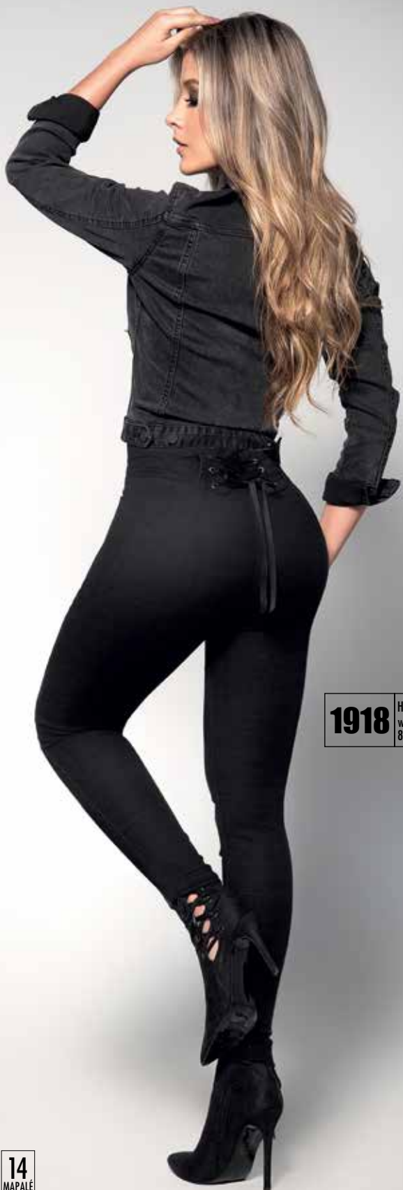
1918 High Waist Butt-Lifting Jeans with Back Bodice Detail 8,10,12,14